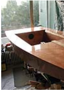
In the living room