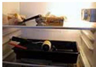
Great idea! Keep the epoxy in the fridge ;-)

Don't clean brushes, trays and rollers etc, just pop them in the fridge! The low temperature will keep the epoxy from curing BUT please don't blame me if the butter picks up an unusual taste!