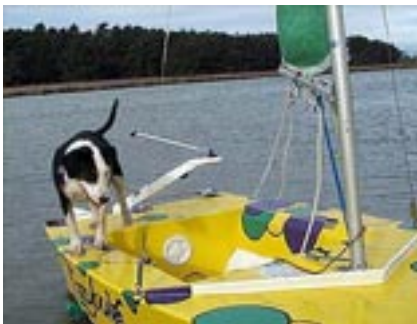
Spot doing the pre-sail checks