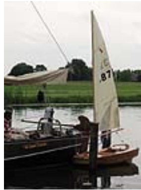
Alongside the 'mothership'