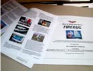
New Plans and Building Instructions

Over the last few months the FireBug plans and building instructions have been completely re done as a major step towards the book 'How to Build and Sail a FireBug'.