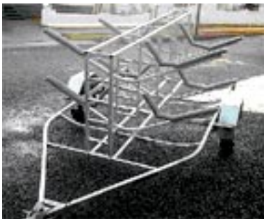
Thames High School's 4 boat trailer