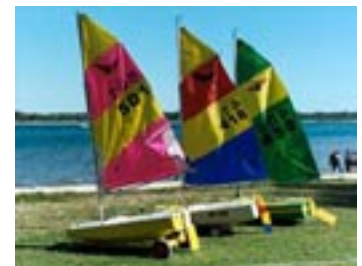
30 degrees and sunny, all day, every day!!