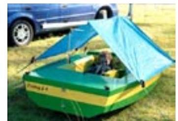
Spoooner boys living on board.