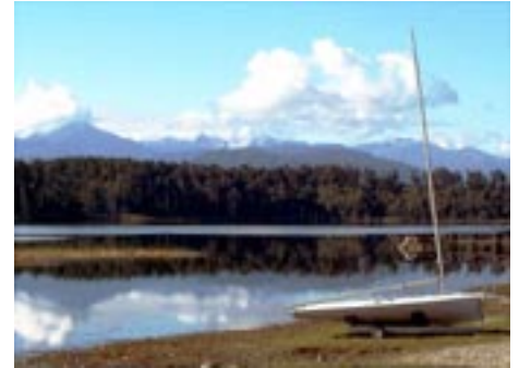
Spectacular scenery at Lake Mahinapua

27th and 28th March also at the Pleasant Point Yacht Club.