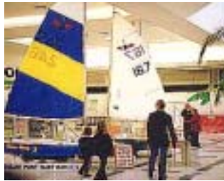
PPYC at the Palms Mall

The Pleasant Point Yacht Club in Christchurch has a long history of successful promotion of new classes, building schemes, membership drives etc. Other clubs should note that their shopping mall displays promoting the club and the Firebug have been very successful at boosting membership.