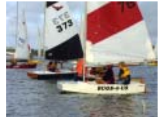
Firebugs at Omokoroa...

Clubs around the country are enjoying adding a few Firebugs to the mix: Omokoroa on the Tauranga Harbour, Dargaville Sailing Club on the Kaiwi Lakes, Ngaroto Sailing Club near Te Kuiti, Lake Brunner, Pigeon Bay and more..