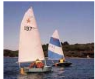
...and on the Kaiwi Lakes