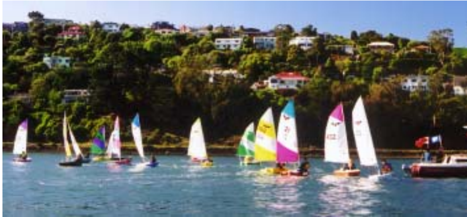
The season's biggest get together - South Island Championships Otago Yacht Club Dunedin NZ