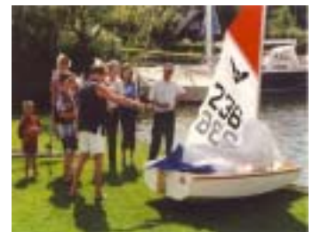
Launching Opa's Bug

Opa's Bug, the Firebug built in the dining room, spent a few weeks on a long summer holiday with the grandchildren last summer.