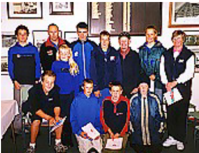
Sailors enjoyed a fun Regatta