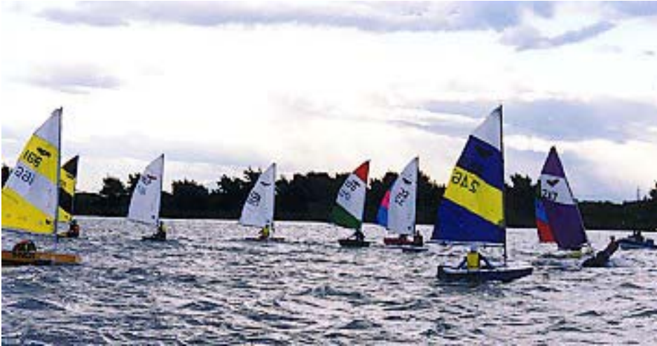
Part of the Friday night fleet at the Canterbury Champs at the Pleasant Point Yacht Club