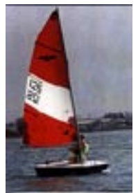
Cathryn Bridges looking nice on the Estuary