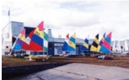
The fleet ready to go at Pleasant Point Yacht Club