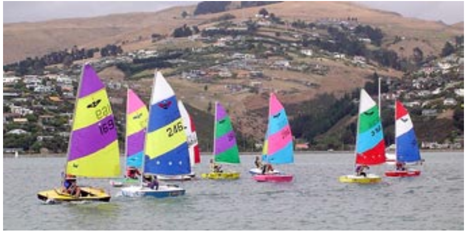
Some of the FireBugs at PPYC in Christchurch for the South Island Championships.

All Enquiries: Peter Tait FBHQ PO Box 47 042 Ponsonby Auckland New Zealand Ph/Fx +64 9 360 1076 email: pete@firebug.co.nz website: www.firebug.co.nz