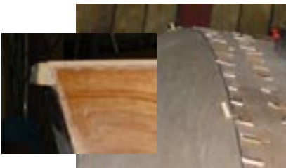
Ross's gun'l overhang and ply pieces.

Ross in Sydney has completed all the woodwork and it looks beautiful. Nails through ply squares hold the ply down better and allow nail removal later. The overhang at the gun'l makes carrying easier, offers protection and is a good hand-hold after a capsizing.