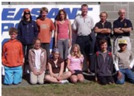
South Island Champs 2006 prize winners: