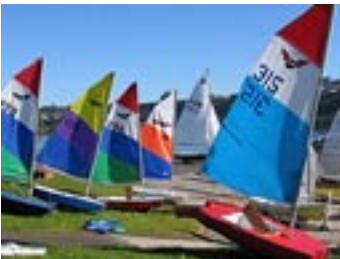
Top rigging and launching area.