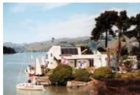
PPYC HQ on the Estuary

Pleasant Point Yacht Club in Christchurch are putting on the first big Firebug Regatta ever - The South Island Champs. It's to be a five race series. Enquire for details.