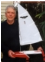
Muchos gracias fellas!

At last - a Firebug website! Sixty five pictures and nine pages of information on all aspects of building and sailing Firebugs. The $2000 site includes something on the designer John Spencer and a gallery page where you can send in a photo of your own boat. Pictures on the page currently number 20 or so with 6 more already lined up to go on. Space is also available for class news, regattas etc.. Future additions include 'How to rig, tune and sail your Firebug' and 'The Basics of How to Sail' complete with sketches etc. Have a look: www.firebug.co.nz and let me know your email address (for future newsletters) and any comments on the infolink on the CONTACT US page.