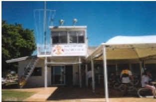
Southport YC liked the idea of a Firebug building programme.

The O'Briens and Patersons from PPYC have just returned from a long holiday in Australia. To break the monotony of blue skies and long white sandy beaches they called on yacht clubs spreading the Gospel on Firebugs.