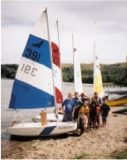
Lake Tarawera Kids Ready for a Sail