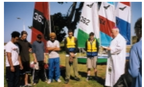
Definitely NOT the Pope!

PPYC, Cathedral College, Avondale College, Auckland's Unitec School of Boatbuilding and Otago Yacht Club, have all featured with Firebugs in various newspapers in the last few months. PR experts Pleasant Point Yacht Club on two occasions. First when the fully rigged boats in the Christmas parade couldn't get under a bridge (?) and then again sharing the story of the Cathedral College Firebug fleet launching. The excellent photos showing the Bishop of Christchurch blessing the Firebug fleet on launching day attracted a lot of comment. One person, suspected computer fiddling, said "How did you get the Pope in there?" Some of the December newsletters had a different photo so here's that picture again: