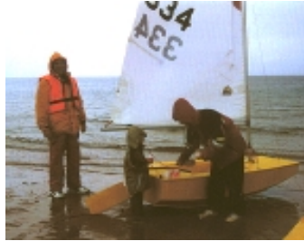
Launching on the Clyde by email

The event was recorded with several rolls of film, so we will send you one either by email, (if we can figure out how), or by normal methods.