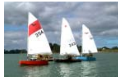
Firebugs with the Starlings at the Clarks Beach Yacht Club for the Secondary Schools Regatta

--Multi-tasking to the max. Bake scones, do the washing, complete tech assignment and BUILD A BOAT!!