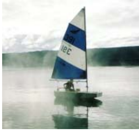
Firebug in hot water on Lake Tarawera!