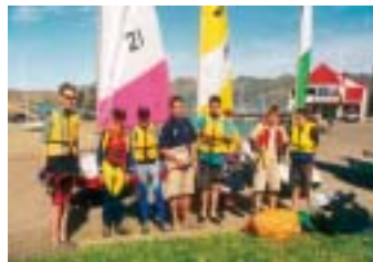
The A-Team at Lyttleton