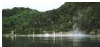
Hot Water Beach campsite.

Well perhaps not - that would be a silly thing to do! What would happen if you fell in? Boiled to death!! So, no it look's like its boiling but it isn't really - just warm on a cool morning to result in a steamy sail for these sailors camping at Hot Water Beach on Lake Tarawera near Rotorua in NZ. The Lake Tarawera Ratepayers Assoc. Sail Training Group had a fun camping/sailing weekend on the lake. A letter from Mr Ian Thorpe describes the trip: "At the sail and camp weekend the trainees sailed all our small boats across Lake Tarawera - a distance of some 12 kilometers - escorted by three families in trailer yachts and two in power boats. No sooner had the fleet arrived at Hot Water Beach than the youngsters all wanted to go local sailing - perhaps the chore of the erection of tents helped their decision. It was a grand day and all enjoyed the hot pools and general fun in excellent weather. On the Sunday morning the local sailing resumed in very light airs but in water so warm that boats sailed in and out of mist clouds. The homeward journey in convoy began well but the main body of the lake was devoid of wind and so most boats accepted a tow home."