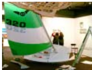
Firebug at the Museum!

The Firebug has found a place at Auckland's Maritime Museum! For a three month period there's a fully rigged Firebug looking great in a display promoting Unitec's Marine Technology Department (School of Boatbuilding).