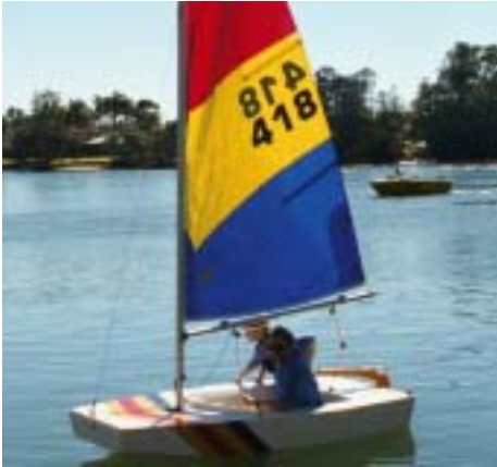
'Debug' on the Tweed in New South Wales!