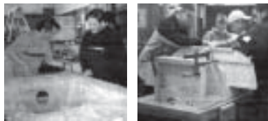
Student boatbuilders at Whitianga and Thames (right)