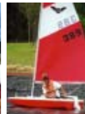
Rigging and sailing the 'Rangitahi Flyer'