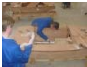
BOP Polytech workshop

Polytech and School Built Hulls There are also polytech and school built hulls and completed boats available at keen prices - freight is not a problem (even to Australia). The quality is good. Contact FBHQ for details.