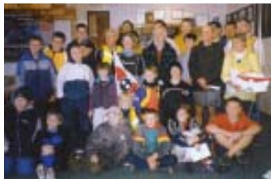
All the skippers

The Pleasant Point Yacht Club's South Island and Canterbury Provincial Championships, held last month in Christchurch New Zealand, attracted 30 entries. The event was superbly well organised and thoroughly enjoyed by all the contestants, friends and families.