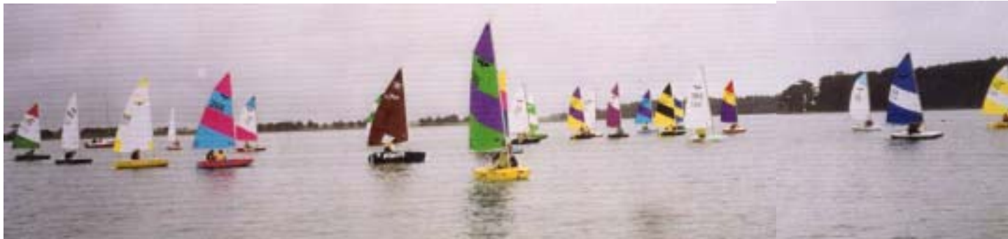
What a sight! A large fleet of Firebugs sailing at Pleasant Point Yacht Club in Christchurch