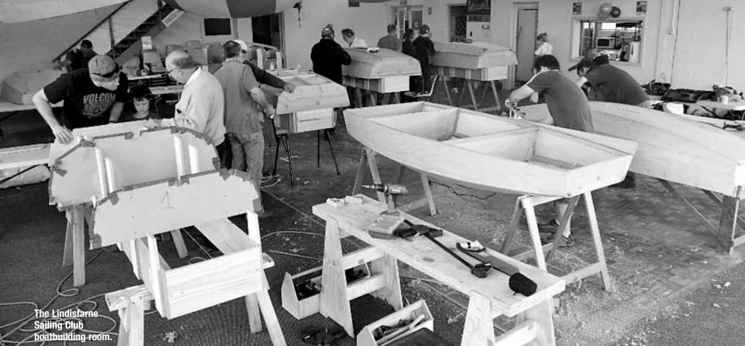
The Lindistarne Sailing Club boatbuilding room.