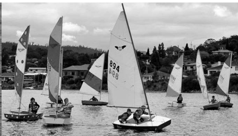
First sail – mayhem on the water!

On the day the light breeze built up to around 25kts but our kids took it all in their stride. A few capsized and a bit of damage was done to the boats. When we finally towed them back to Lindisfarne the kids were saturated, some of the parents too, but they had a great adventure and haven't stopped talking about it.