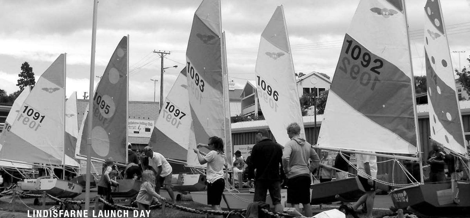
LINDISFARNE LAUNCH DAY