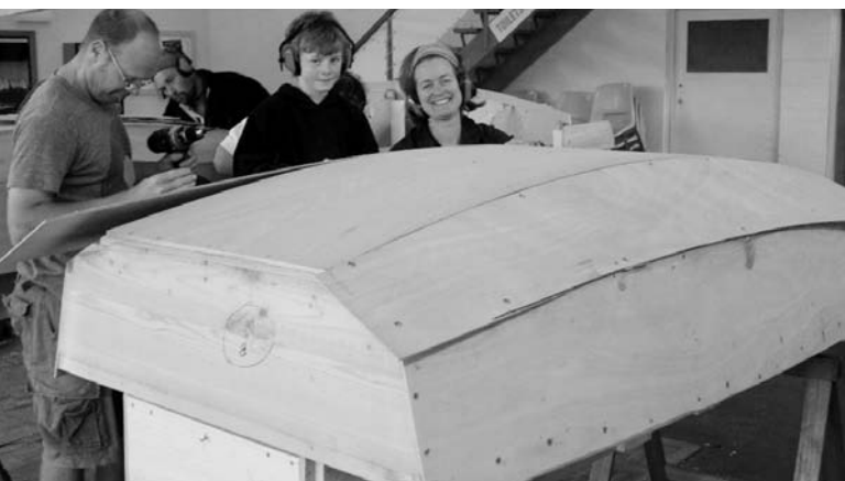
The whole family helping.