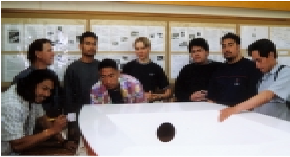
Mangere College students are pleased with their work