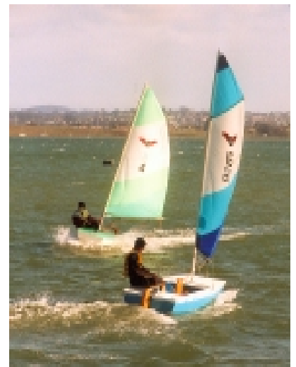
Brett and Chris at Pt Chev Sailing Club

The Point Chevalier Sailing Club in Auckland conducted a successful series of races over the winter. Fortnightly and with up to 3 races per day it proved to be a perfect opportunity for testing and tuning the FB under race conditions. Twelve boats appeared at different times over the series and a regular fleet has established