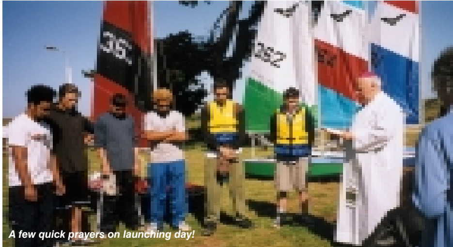
A few quick prayers on launching day!