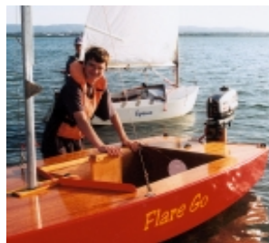
'Flare Go' at PCSC

The Hogg family's 'Flare Go' Has the answer for windless days - an outboard! A bracket attaches to the rudder pintles, the outboard clamps on and away they go!