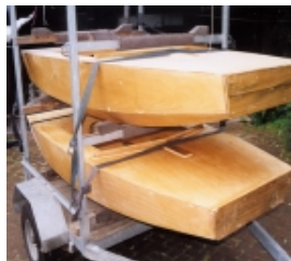
LTRA hulls leaving Unitec

The Lake Tarawera Ratepayers Association near Rotorua has initiated a program to get some of the local kids afloat. Two Unitec hulls complete with FBHQ kits have been despatched with Now Parcels and launching is a couple of weeks off.