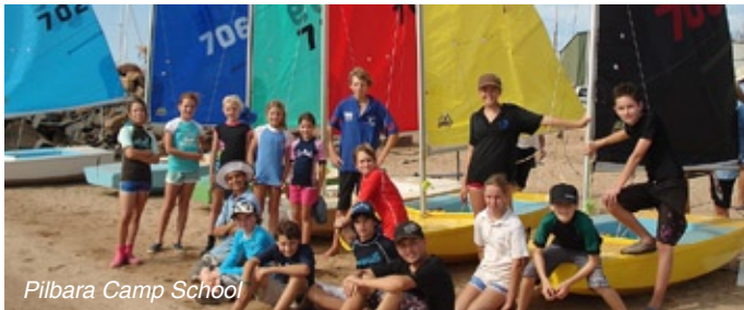
Pilbara Camp School