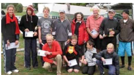
Winners in the NZ South Island Champs - a 50/50 mix!