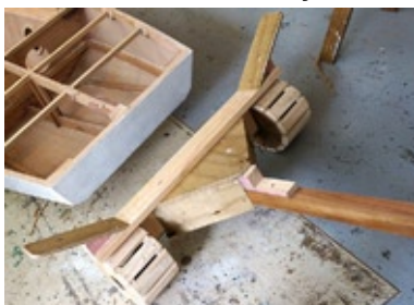
John Thetford from Whangarei NZ knocked up this beach trailer from scraps - nice job!