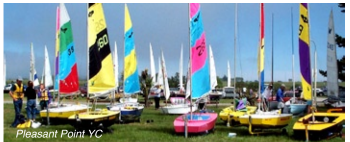
Pleasant Point YC

FireBugs are turning up to regattas in larger numbers as clubs and owners get the hang of this extremely versatile sailboat which sails well with either kids or adults!