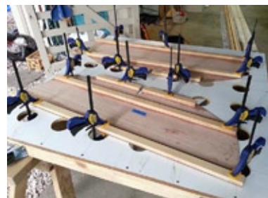
Dugald's ingenious workbench with holes enable clamping for all corners!

In general 'Bug builders never cease to amaze me with original ideas and cool gadgetry. Warwick Mowbray who built a 'Bug with only one arm still takes the prize (see last issue) but look at these good tricks from Dugald McKellar in Brisbane.