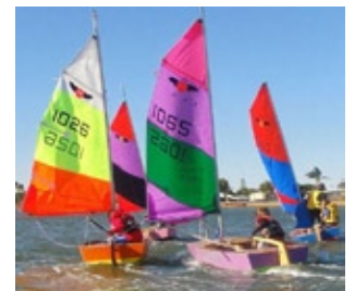
Carnarvon mixed fleet, some reefed.