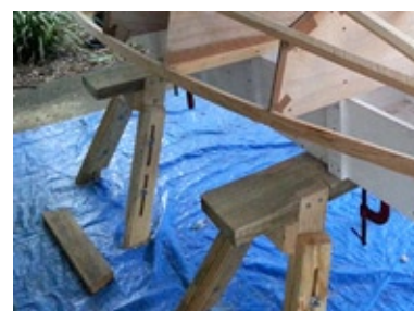
Clever adjustable height saw stools!