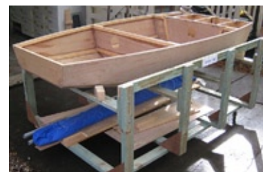
This boat rack is on wheels so it can move the boat outside to free up the space!