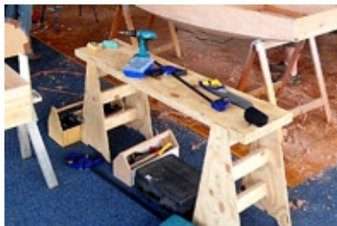
Des Clark's portable workbench from the Lindisfame Sailing Club group build. The top can take a wood vice to make it even better!