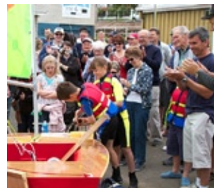
Lindisfarne's fantastic launch day.

Several sailing clubs who do 'Bug racing regularly would like to see some inter-club competition. It's a fun idea and the only issues are distance. Perhaps to get things underway we should look at borrowing boats but use own sails and foils? Who starts the ball rolling? It would be a refreshing style of interclub racing - forget the complexities and dramas of the Olympic classes - what we envisage would be mixed fleets of kids and adults doing the racing, other family members enjoying a holiday, at a nice destination which could be part of a tour - think: NZ South Island, Hobart, Sydney, tropical Carnarvon. All the likely venues are popular tourist centres so that's a great start! Ideas are welcome.. like what about a Sydney Hobart 'Bug Regatta?