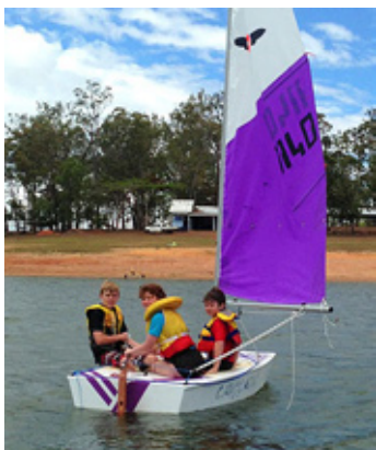
The Connolly children sharing the first sail

Look!! Eight Footer Regatta at CRSC Living in small flats is causing storage problems for sailors. The 'Bug however still fits, standing on its transom behind a car! Concord Ryde SC in Sydney are holding an 8 foot regatta in March to find the best eight foot club racer for adults and kids. Prizes include a GoPro camera. Contact Ross on 0418 457 020