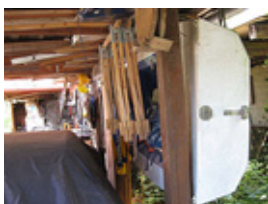
Would the owner of this 'carport wall' please give me a call and explain the position!!