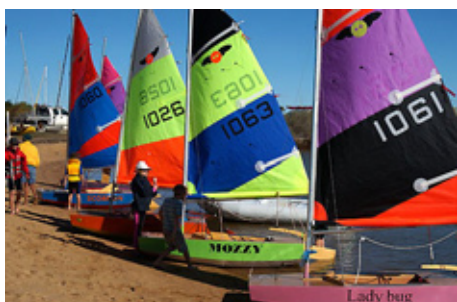
On the beach waiting for the wind to lighten up!

Pete from FireBug Yachts made a visit to Lisbon in Portugal to meet the team and check out the 'BugBuilders'. The club building provided by the Lisbon City Council has prime location at the bottom of the city. The area in the old days was the off loading place for fishing boats. Today the NCBE runs a sailing school using the same well trodden cobblestone foreshore! As well as the sailing school the group runs boat building classes for handicapped people, cerebral palsy sufferers and poor kids including some Gypsies, partly government funded. We spent interesting days at the club, meeting the sailors and builders and had a good look around the beautiful city of Lisbon. We enjoyed our visit immensely and are looking for an excuse to return! Many thanks Carlos, Antonio and all, keep up the good work!