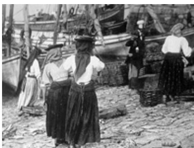
Same cobblestones, different century! The Club operates from the building on the water's edge.