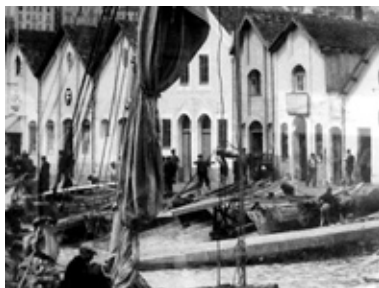
Same buildings, different usage! The fish market becomes a modern day sailing school.