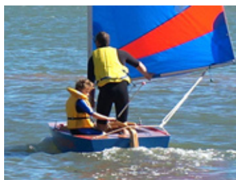
Carnarvon father and son