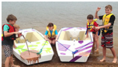
The Connolly family in Herberton Queensland launched two new boats with chocolate milk!