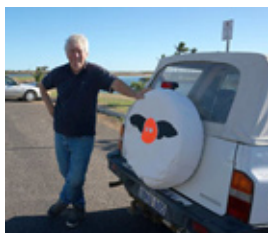
The 'BugMobile in Carnarvon!