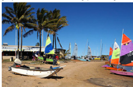
Superb Carnarvon Yacht Club on its own beach