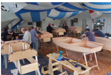
The building hall at the Lindisfarne club