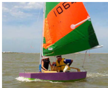
Leg-in-plaster not a problem to 'Bug sailor!

Leg in plaster - not a problem! A Dad with a broken leg teaching his daughter to sail - now that's dedication!