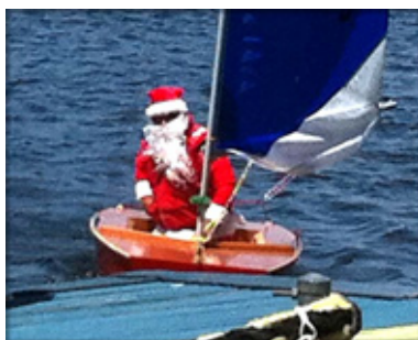
Sensible Santa has a reef in - maybe can't swim?

At Lindisfarne last Christmas it was a case of: "Well, shiver me timbers! Santa is sailing around in a FireBug!" I hope he was very careful - living at the North Pole he wouldn't ever have learned to swim!