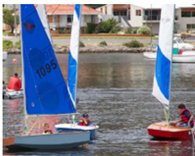
Young sailors trying out their boats in light wind