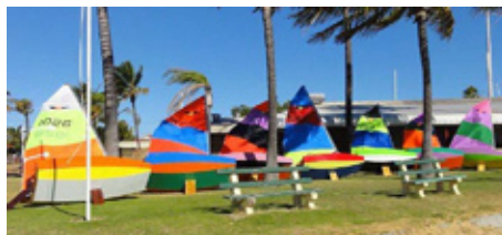
Carnarvon Y C boats set new standards for colour!