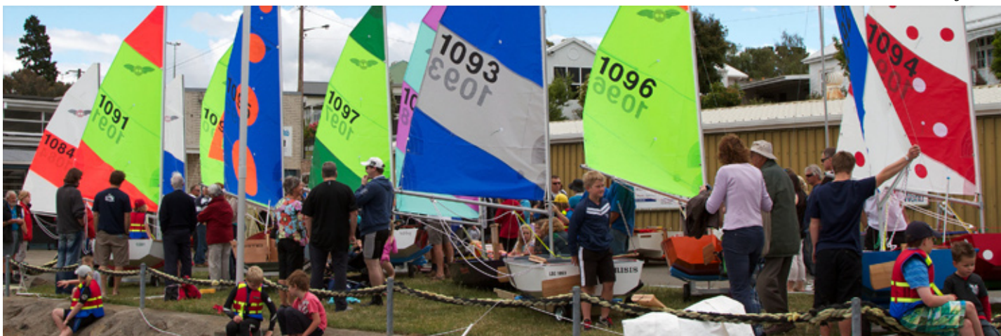
Excitement in the air as the new 'Bug fleet gets ready to launch for the very first time at the Lindisfarne Club in Hobart, Tasmania, Australia