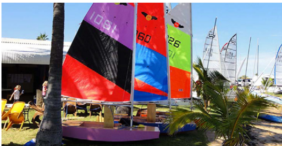
FireBugs take their place on the beach at the Carnarvon Yacht Club in tropical Western Australia