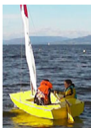
Capt'n Jim's on the Clyde

"Real Life Skills - Build a Yacht and Learn to Sail!"