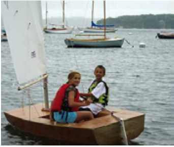
Nice first sail with the Classic Herreshoffs