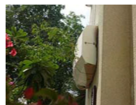
Sliding down the wall!