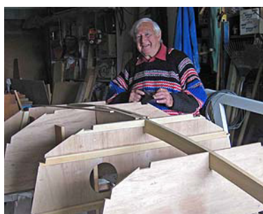
Retired boatbuilder doing a precision job in Russell