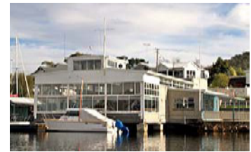
Lindisfarne Sailing Club Hobart Tasmania