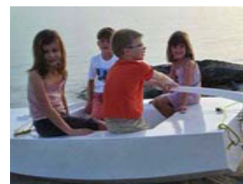
'Pick meee!' - all want the first sail!