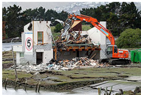
Mega 'Ouch!' at PPYC in Christchurch NZ