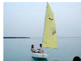
Looking nice but not much 'puff'.