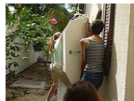
Good catch by the ground crew.