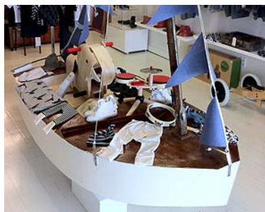
Handy clothes rack in trendy shop!

I spotted this old P Class being used as a clothes horse in a trendy Ponsonby children's clothing shop and thought it very funny! The P is NZs unique race trainer for kids. The boat is expensive and difficult to sail but that's its strength - if you can sail a P well you can sail anything! Race fleets attract a large following of 'P Class Dads' shouting from coach boats.