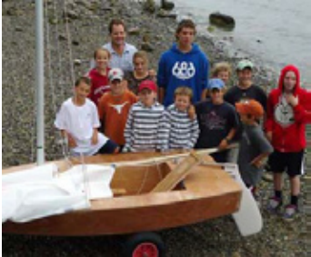
Keen crowd at the launch in Boston, Maine.