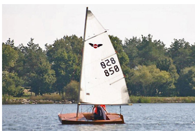
The Pellisier Family afloat in France, classic!