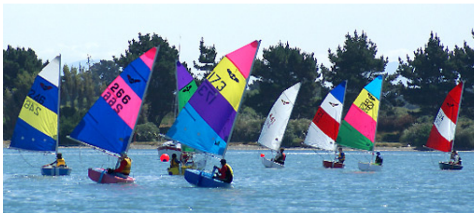
Part of the 14 boat fleet for the South Island Championships held this year at the Pleasant Point Yacht Club