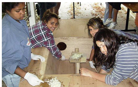
Girl Boat Builders - fun times, learning with the FNC!