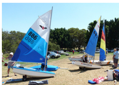
Rigging up at CRSC in Sydney.

Concord Ryde Sailing Club issued an invitation to Sydney Firebug sailors and builders to join its active group for an official function on 7 th February 2009. The morning was spent getting less experienced sailors and family afloat, some for the first time.