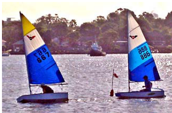
'White Dwarf' finishing seconds ahead of 'Gum Leaf' after 3 hrs of racing at CRSC.

And after lunch the 'Bugs returned to the water, not to race but to continue their lessons and to demonstrate their capacity to sail confidently in a wind building up to some 20 kts. One of the key strengths of the Firebug was well displayed - two adults in an 8 footer having a useful sailing lesson!