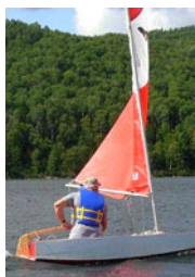
Ian Craik's 'Jessie C' on the water in Canada.