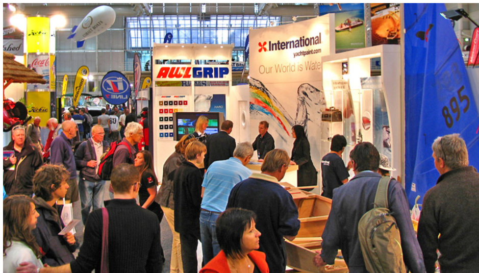
The popular live 'BugBuild on the International Paints stand at the 2008 Sydney Boat Show blocked the aisles...