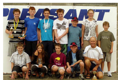
Sailors at the PPYC South Island Champs.