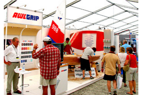
A live 'BugBuild with International Paints at the Auckland Boat Show in February

All Enquiries: Peter Tait FBHQ PO Box 47 042 Ponsonby Auckland 1144 New Zealand Ph/Fax +64 9 360 1076 email: pete@firebug.co.nz website: www.firebug.co.nz