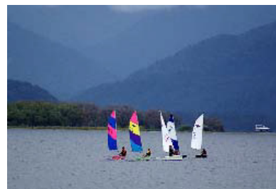
Spectacular backdrop for the SI Champs.