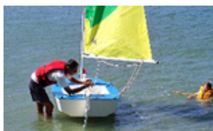
'Puddles' getting ready for a sail