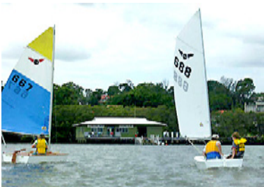
Two 'Bugs sailing with the Concord Ryde SC.

Concord Ryde Sailing Club has over 60 years experience of building, sailing and racing small boats on the Parramatta River. The friendly family club has a small but active group of FireBug enthusiasts and more boats underway.