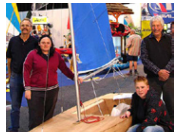
Happy FNC builders, Sydney Boat Show.

In August the FireBug RoadShow did a live build at the Sydney Boat Show. The 'workers' were young people from the Forster Neighbourhood Centre, the sponsoring company was once again International Paints who donated the boat to the FNC for their learn to sail fleet. Full story next issue..