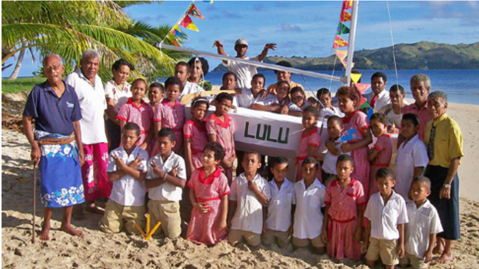
Launching day celebrations in the Lau Islands, Fiji.