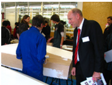
Hon Chris Carter taking a look!

At the recent new technology block opening at Glenfield College in Auckland the NZ Government Minister of Education the Hon Chris Carter was most impressed with the Firebug and the 'Learning by Doing' successes. The Hon Chris is also Minister for Ethnic Affairs. A meeting has been arranged to discuss things further..