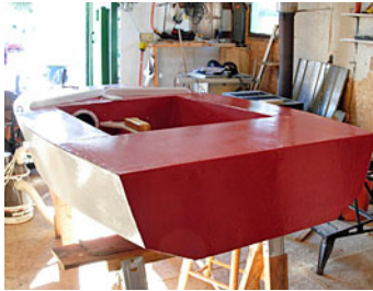
Waiting for the temperature to rise!

Ian Craik in Canada has stopped work for the winter.. "The ice on the lakes is 2ft thick, snow 3ft deep and -28 C outside!" So Ian is heading to NZ for a holiday.