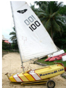
Vanuatu turtle chaser