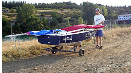
On the way to the beach, heart in mouth!

The Mentor was shouting orders from the shore, but for first few seconds I couldn't hear anything.. All seemed so messed up.. when I tried to pull in the main sheet, I was forgetting about tiller, than when I would grab the tiller, the sheet would go out of control.. The boat heeled crazily, and I was on the verge of capsizing, but than I instinctively jumped deep into the cockpit and kneeled near the centercase and tried to figure out what's going on from this position. Then I heard the mentor screaming to put the centerboard all the way down, and that's when I remembered I had a centerboard!:) I squeezed it all the way down, and boat became much more stable instantly..