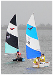
The Mogg's 'Firepower' v 'BugBez' in Queensland