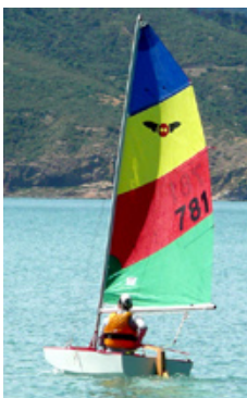
'Fire Dragon' on French Farm Harbour