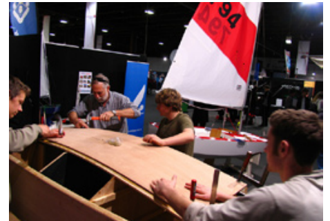
FireBugBuild live with Yachting New Zealand