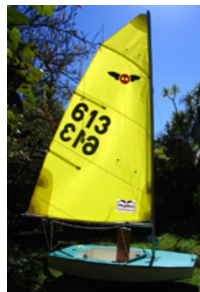
Sails will now carry a 'BugBits label.

'Bug sails are being made by a new sailmaker and will carry the 'BugBits label. All is high quality, still made in NZ and with a full range of colour options. The cut has been fine tuned again.