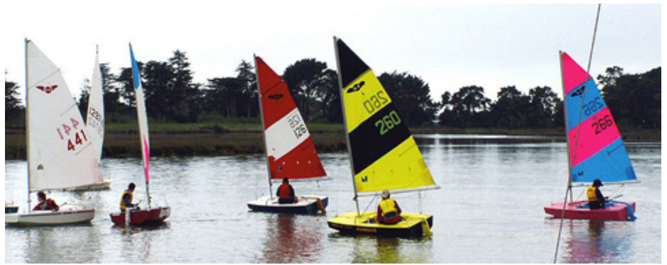
Cold and grey conditions at the Pleasant Point Yacht Club in Christchurch for the Closing Day races.