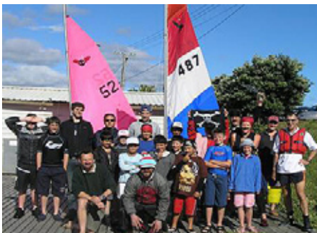
The keen sailors at Titahi Bay, Wellington.

Two Unitec built hulls have been purchased by Titahi Bay Sailing Club. The boats will be used mostly by local kids but anyone can have a sail - the more, the merrier. Any other 'Bugs in the area are also welcome! Contact Hugh: 021 396 417.