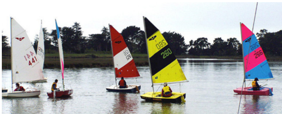
Cold and grey conditions at the Pleasant Point Yacht Club in Christchurch for the Closing Day races.