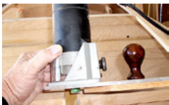
The router attachment

Richard explains "The T Square has various dimensions annotated for accurate setting out, eg to center the #1 chines from the centerline string. The little planer attachment I built for my trim router - the end cutting bit can be adjusted very close to flush and this makes it ideal for trimming the chines to the transom and the 9mm bottom ply."