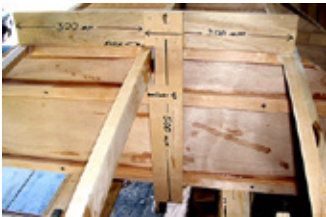
The tee square works from the centreline.