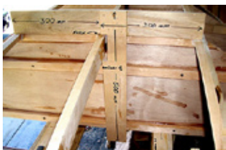
The tee square works from the centreline.