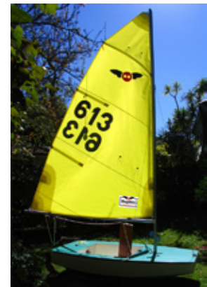
Sails will now carry a 'BugBits label.

'Bug sails are being made by a new sailmaker and will carry the 'BugBits label. All is high quality, still made in NZ and with a full range of colour options. The cut has been fine tuned again.