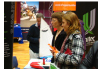
Scale model 'Bug at Glenfield College.