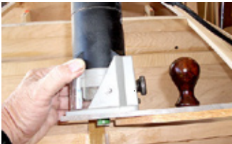
The router attachment

Richard explains "The T Square has various dimensions annotated for accurate setting out, eg to center the #1 chines from the centerline string. The little planer attachment I built for my trim router - the end cutting bit can be adjusted very close to flush and this makes it ideal for trimming the chines to the transom and the 9mm bottom ply."