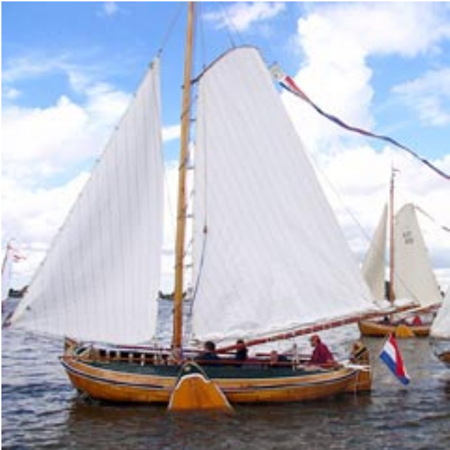
One of the smaller boats showing leeboards and rig.