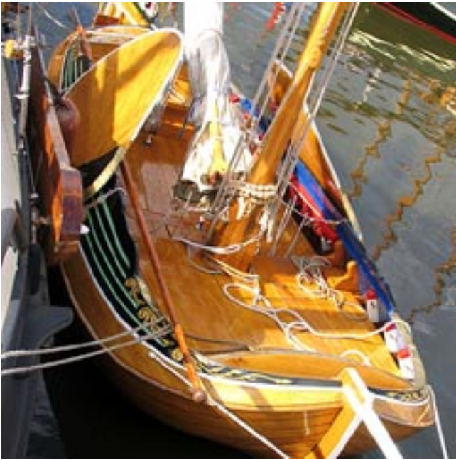
An extraordinary workmanship and maritime artistry.