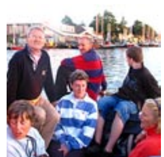
Plenty of time for socialising and relaxing.