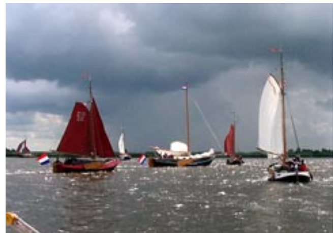
Race day scenes could have been 200 years ago or a multi-million dollar oil painting by an old master!

Performance wise there were no surprises and it all reverted to the basics - it seems that with all sailing boats, old or new, all sizes, the rules just stay the same - good balance, nice flow over the sails, clean underwater lines and smart crew. Generally boat handling was first class.