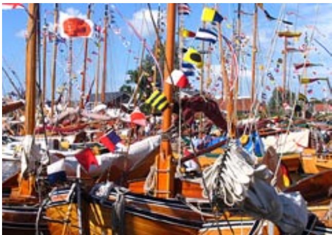
Gleaming varnish, flags and excitement in the air.

Dutch friends Koos and Bert had invited me to spend a few days with them at a 'antique boat regatta' but I hadn't expected anything on this scale. Two hundred and fifty classic boats, all in sparkling condition, some dating back as far as 1820 were tied up in town ready for a big celebration. Crowds of onlookers were wandering around and Grou (near Sneek) was all dressed up.