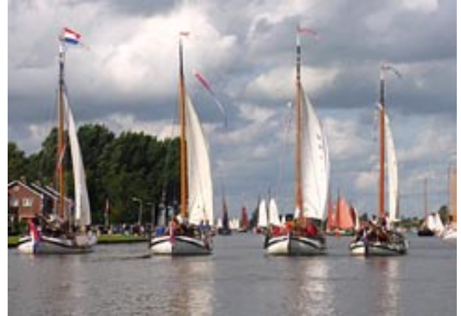
Lining up four abreast for the Queen.

The Queen's 'de Groene Draeck' (Green Dragon) and several of the other larger examples were the stars of the show. 'Ooohs' and 'aaahs' were heard as they passed by - powerful boats with large 'hissing' bow waves pushed up by the blunt bows.