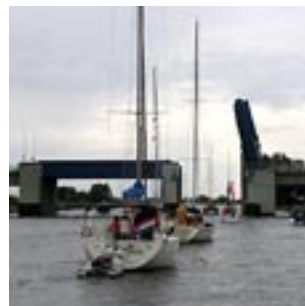
Heading off home.