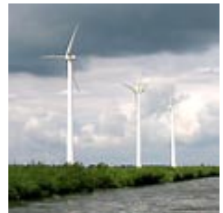
All types on the waterways but only electric windmills!