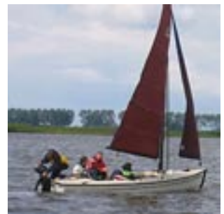
Small charter boats.