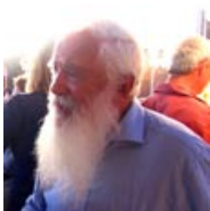
Big budget, casual prize giving and ancient mariners.