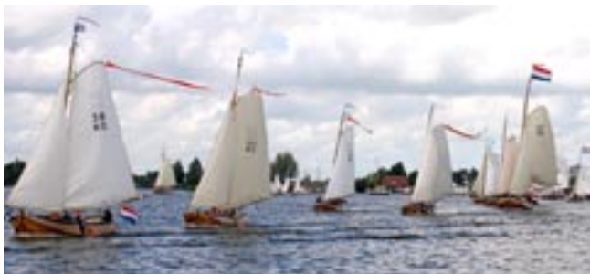
Stylish racing fleet on the square lake.

Overall the organisation was tops, the sailors had a great time, the boats were simply stunning, real boats and real people, no loads of bull from sponsors and the like, and the final evening prize giving capped it off nicely - a casual yet grand affair under crystal chandeliers.