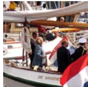
Real Queen at the helm.