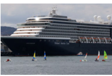
Large obstacles on the race track, Tassie Champs