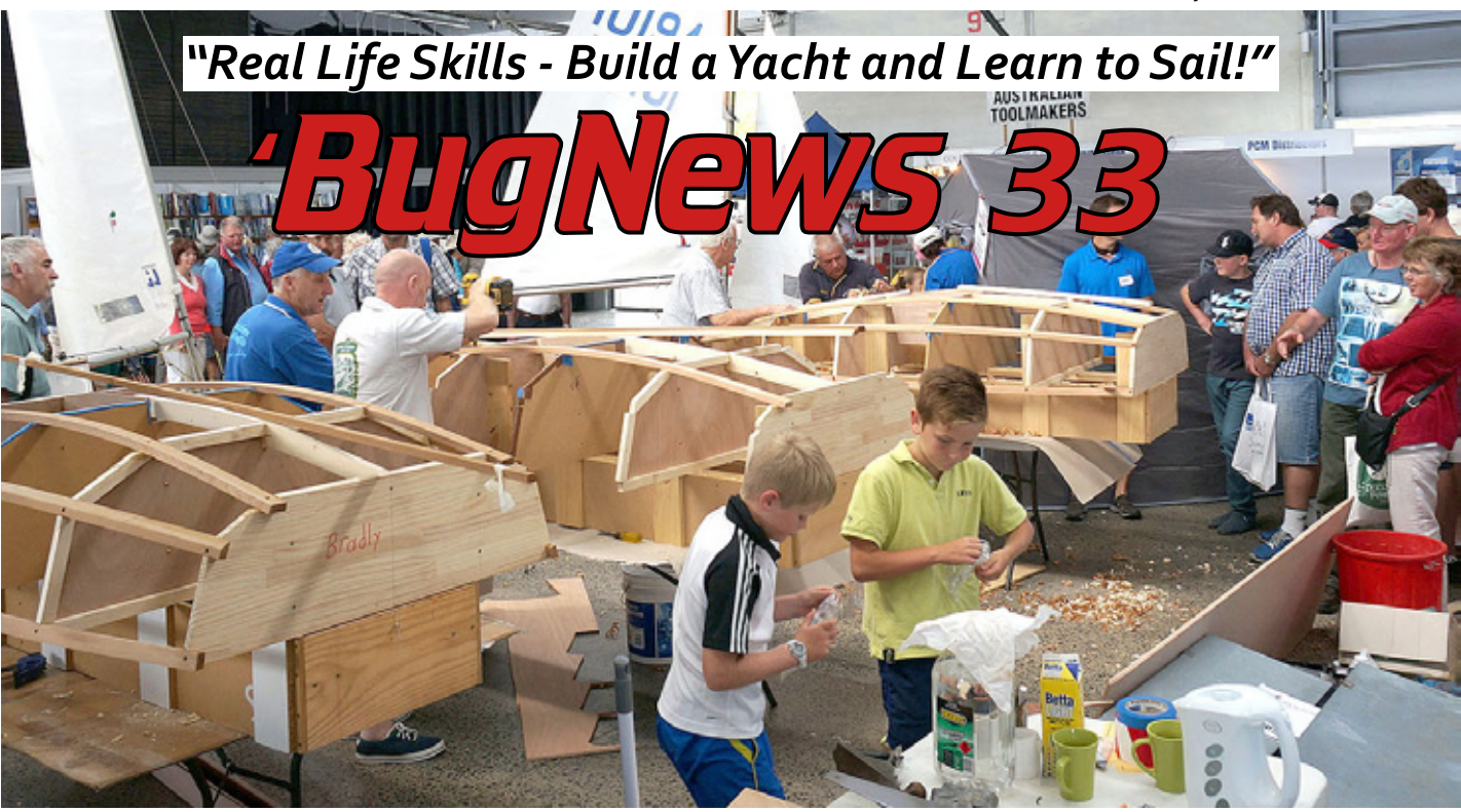
What a sight! Lindisfarne Sailing Club fleet building 'Bugs at the Australian Wooden Boat Festival in Hobart, Tasmania. There's excitement in the air!!

Lindisfarne at the AWBF in Hobart! The Australian Wooden Boat Festival in Hobart is a biennial feast for 70,000 wooden boat nuts! I was there again this year as the Lindisfarne Sailing Club built three 'Bug hulls at the show and simultaneously sailed the Tasmanian FireBug Champs in the waters adjacent the show. It was a huge success - one wise looking and older woman said "This is the best stand in the whole show - just look at all those kids and grownups having so much fun!"